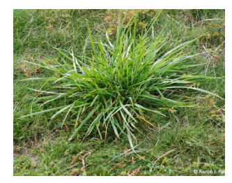
Normal Fescue growing in a pasture.

The mare's placenta is also affected by toxic ergot alkaloids. It causes suboptimal placental function and increased placental thickness which can be measured by a veterinarian via transrectal ultrasound. Despite placental insufficiency, foals continue to grow extending the mare's typical gestation time (≥360 days). Prolonged gestation increases the risk of dystocia and premature placental separation. This consequently can cause abortion, red bag delivery, and increases the mare's risk of a retained placenta and getting a uterine infection.