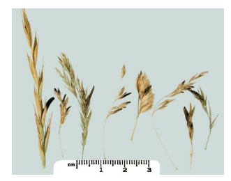
Tall fescue infected with endophytes.

Agalactia is a condition characterized by decreased mammary gland development and milk production. This condition occurs when prolactin, a hormone needed for normal lactation initiation and mammary gland development, isn't secreted properly. In normal physiology, dopamine inhibits prolactin secretion at the level of the anterior pituitary gland. Ergovaline is a potent dopamine agonist which mimics the actions of dopamine. When high levels of Ergovaline circulate in the mare, it inhibits prolactin secretion from the pituitary gland. Therefore, prolactin levels are very low causing agalactia. Hypoprolactinemia (low prolactin), is a hallmark characteristic of equine fescue toxicosis.