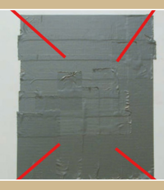
Step 4: Construct a duct tape boot as shown below to cover the bottom of the bandage. Cut along the diagonal red lines to help fit the tape to the hoof better. A slipper can also be used over the hoof in place of the duct tape boot.