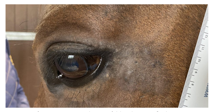
Figure 1. An occult sarcoid by the eye of a horse

Sarcoids can be split into 6 different categories: occult, verrucose/warty, nodular, fibroelastic, mixed, and