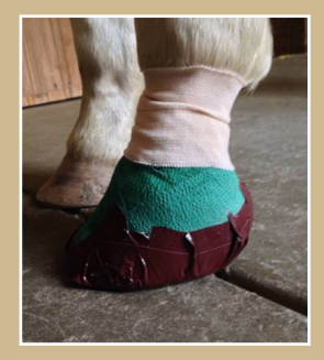
Step 3: Wrap elastikon around the horse's leg so it covers the skin, diaper, and top of the VetWrap a couple times. This helps prevent any debris from entering through the top of the bandage. Stretch the elastikon before wrapping it around the leg to ensure it is not too tight.