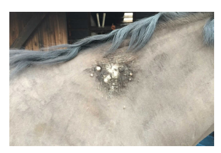
Figure 5. A mixed (verrucose and nodular) sarcoid on the neck of a horse