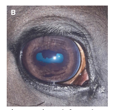
Figure 3. Iris cyst before and after diode laser therapy. (A) Eye before laser therapy. The iris cyst is present on the lower margin of the iris and normal corpora nigra is on the upper margin of the iris. (B) Same eye as 3A after laser therapy.

then lead to clinical signs such as headshaking and changes in behavior such as spooking, decreased performance, or mistiming a jump. The iris cysts can also be small enough that they do not block the visual field of the horse or cause any clinical signs.<sup>3</sup>