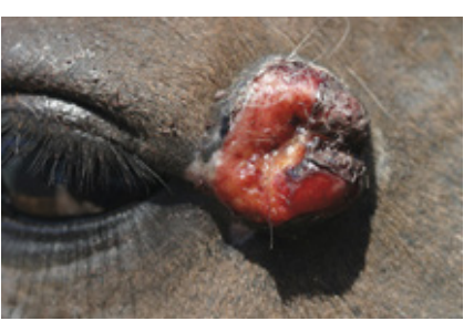
Figure 4. A fibroelastic sarcoid around the eye of a horse