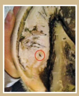
Examples of subsolar abscesses indicated by red arrows and a red circle. Image courtesy of American Farriers Journal (2018).

need to be kept in a clean, dry area to protect the hoof until it is healed, which may mean stall rest for the horse. A tetanus booster may be recommended if a puncture wound is suspected to have caused the abscess.