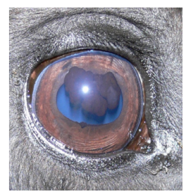
Figure 2. Large iris cyst covering most of the pupil and most likely blocking the vision of this horse.<sup>4</sup>