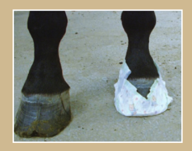
Step 1: Place a poultice pad over the abscess site, then secure it in place with a baby diaper with the toe in the crotch of the diaper.