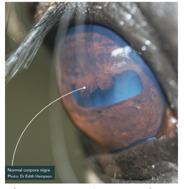
Figure 1. Normal corpora nigra in the upper aspect of the iris.<sup>2</sup>

Iris cysts are the most common cause for the corpora nigra of a horse to become abnormal ( figure 2 ). The iris cysts form when the lining of the corpora nigra secrete a viscous material causing them to swell and grow. This material accumulates leading to the enlargement of the corpora nigra and the formation of a smooth and round cyst. One may find a single cyst or multiple on one or both eyes. Even though the iris cysts are not painful, they can be large enough to extend over the pupil and block the visual field of the horse. These large cysts can